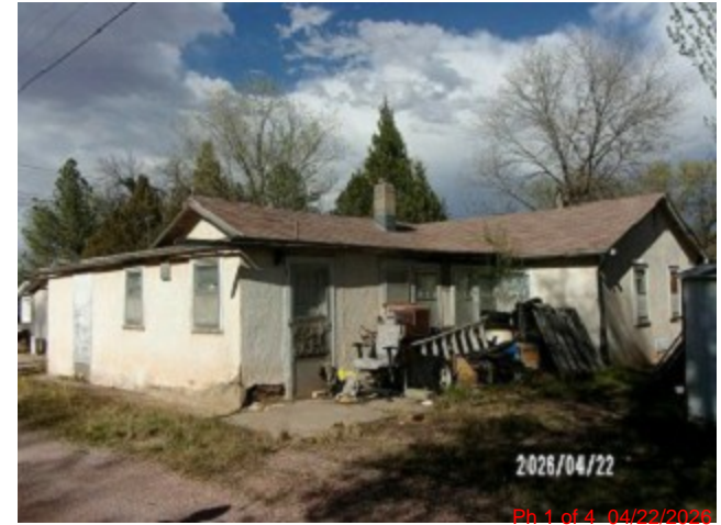
Front of house (on alley)

PN 75500-02600-005-00 Section Deeded Acres 0.000 Deed FALL RIVER COUNTY Township 07 Lot 5 Contract Range 5 Block 26 Address 242 S 16TH ST Loc. / Class Urban / Residential Map Area HS-College Hill(S) Abs Class D Route Number 2H2-313-05Z Plat Map Legal STEWARTS ADDN TO HOT SPRINGS: LOT 5, BLK 26